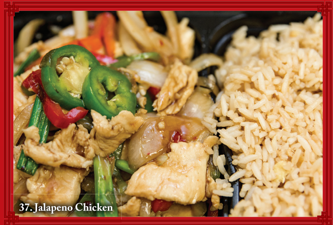
37. Jalapeno Chicken