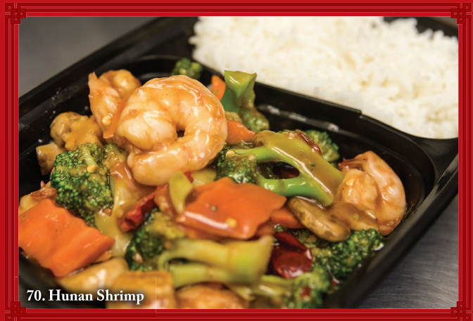
70. Hunan Shrimp