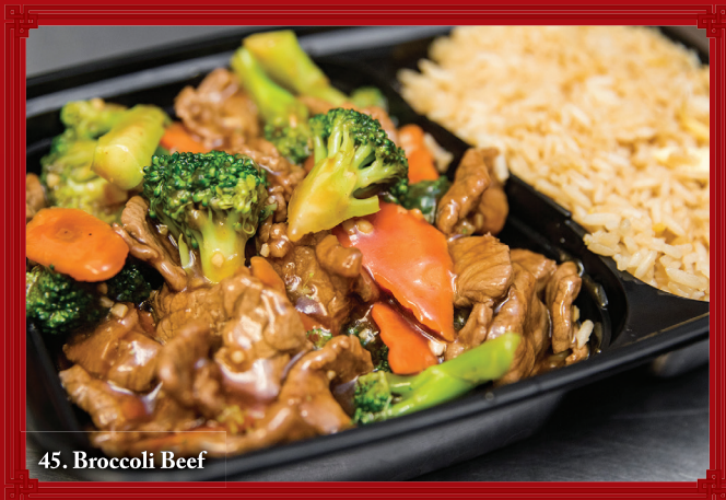
45. Broccoli Beef