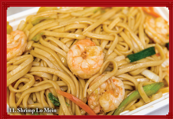
11. Shrimp Lo Mein

Single Entrée Includes Choice of Crab Rangoon (2), Egg Roll (+$0.30), or Soup - Large Entrée Served Family Style & Does Not Include an Appetizer