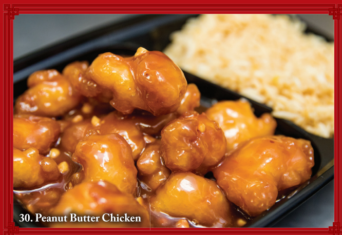
30. Peanut Butter Chicken