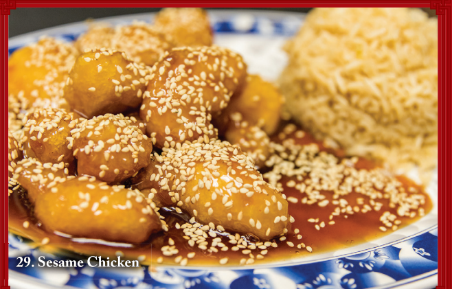
29. Sesame Chicken