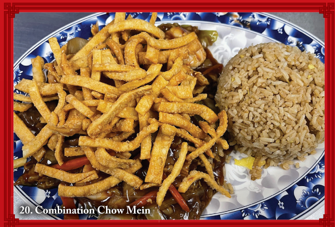
20. Combination Chow Mein