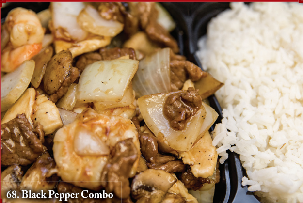
68. Black Pepper Combo