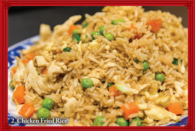
2. Chicken Fried Rice