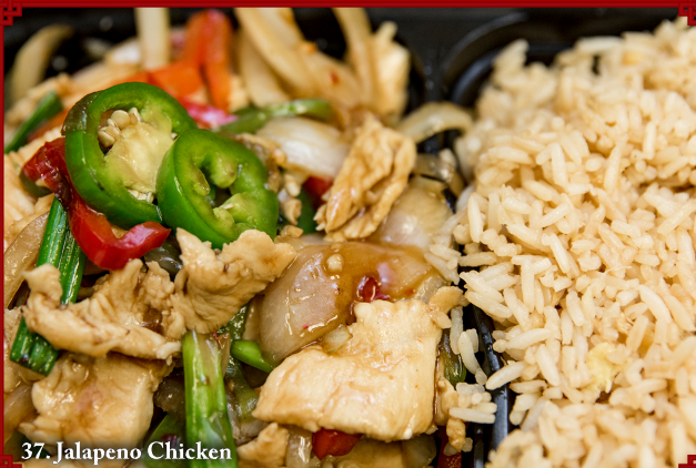
37. Jalapeno Chicken