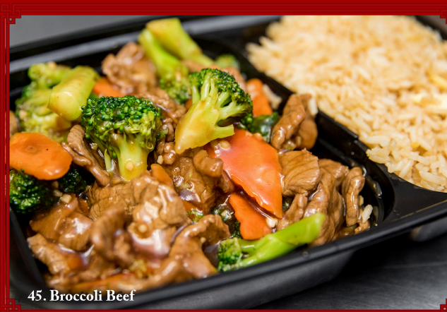
45. Broccoli Beef