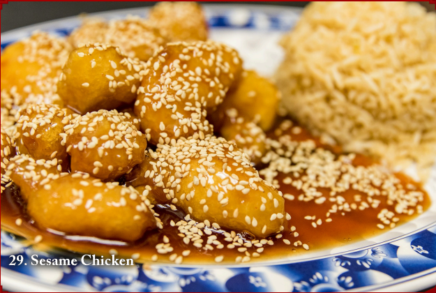
29. Sesame Chicken