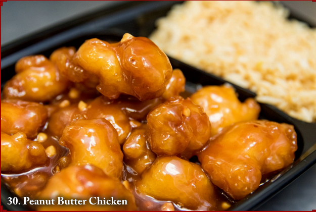
30. Peanut Butter Chicken

Single Entrée Includes Choice of Fried Rice, Steamed Rice, Lo Mein or Steamed Mixed Vegetables (+$1.25) AND Choice of Crab Rangoon (2), Egg Roll (+$0.50), or Soup Large Entrée Includes Choice of Fried Rice, Steamed Rice, Lo Mein or Steamed Mixed Vegetables (+$1.25). Served Family Style & Does Not Include an Appetizer