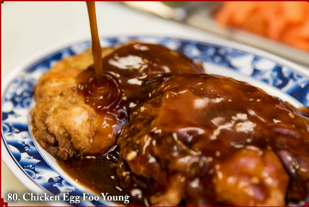
80. Chicken Egg Foo Young

Large Entrée Includes Choice of Fried Rice, Steamed Rice, Lo Mein or Steamed Mixed Vegetables (+$1.25). Served Family Style & Does Not Include an Appetizer