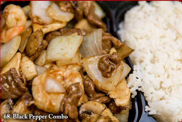
68. Black Pepper Combo