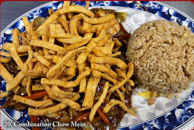
20. Combination Chow Mein