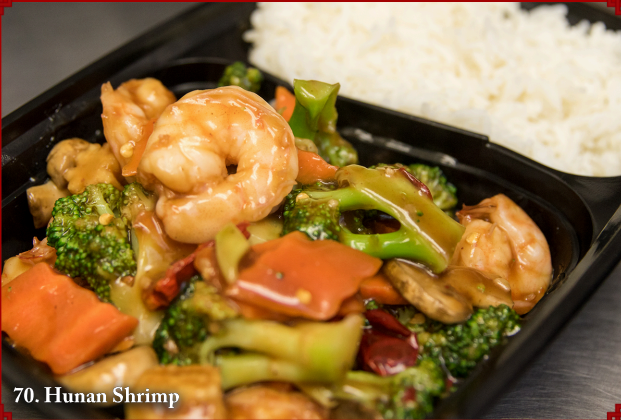
70. Hunan Shrimp